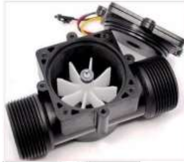
Fig 2. Flow Sensor

Flow sensor works on Hall Effect method. It acts like easy frequency counter. It produces a series of pulses which are proportional to the spot waft rate. The equation of float rate of fuel can be shown as follows: