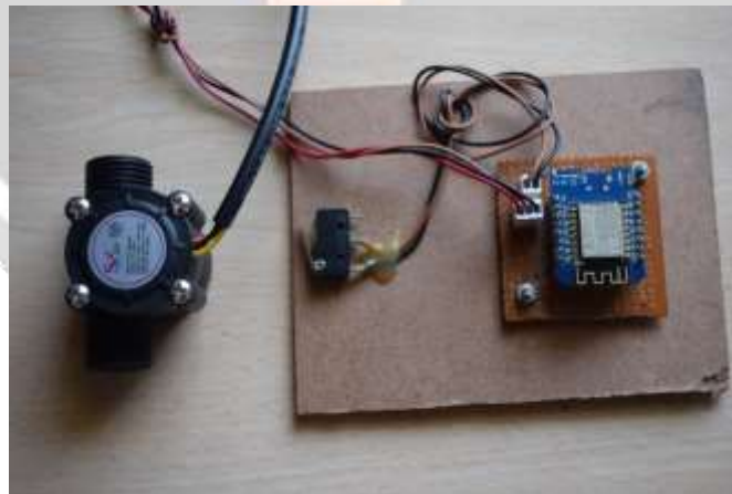
Fig 3. System Design

As soon as some agent starts filling petrol in your bike/car, the flow sensor activated. This flow sensor will be active till flow ends. Once the flow started, application will start reading pulses, as soon as flow ends it will calculate the amount of fuel inserted and convert it into liters and then it will send result to the ESP8266 that is a Wi-Fi chip .ESP8266 sends this data to the cloud server through the secure communication .And it will directly notify on user's mobile phone that how much amount of fuel is currently inserted. This application will also help user to track location from where user deposited fuel and how much on Google map.