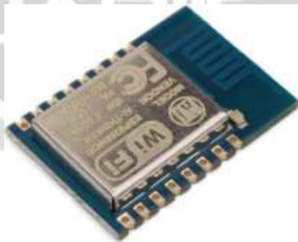
Fig 1. ESP8266 Wi-Fi chip

ESP8266 is a Wi-Fi chip having entire TCP-IP stack and micro manage unit. In this small device there are microcontrollers which can be connected to the Wi-Fi community and TCP-IP connection occur. This chip is very light and very inexpensive than external other component.