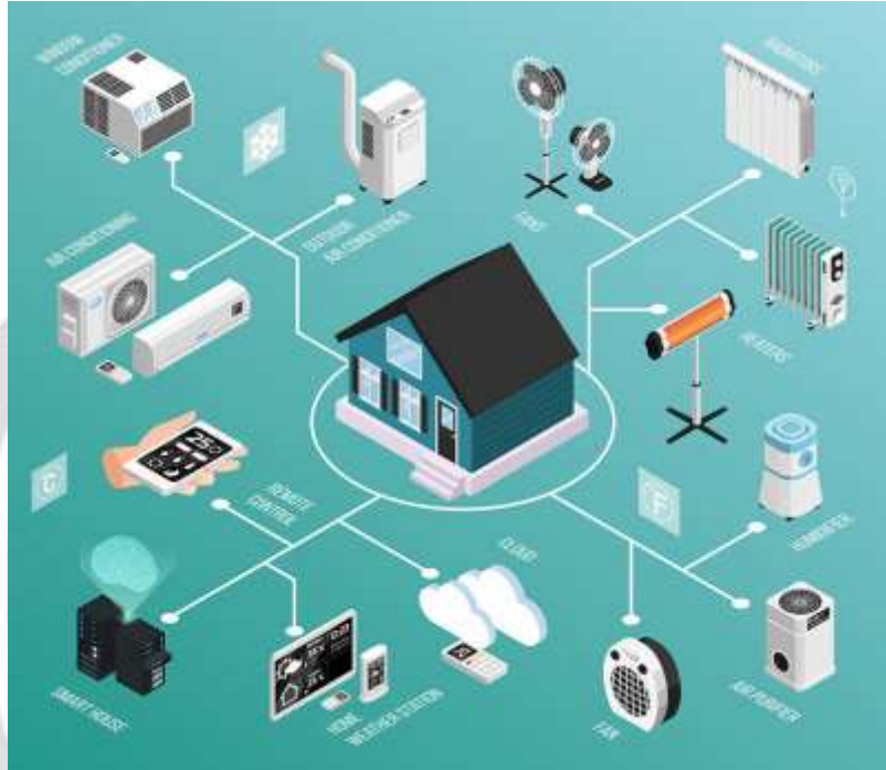
Fig -1: Internet of Things

Perception layer has real-time appliances such as Camera, pen drive, sensors etc. Data is sent to the next layer from the perception layer. Network layer is the middle layer that acts as a connection between physical world and virtual world. Application layer is the application developed for smart homes, cities, smart agriculture and e-Health. This layer is the client end layer where the user gets information according to which the user can control the appliances.