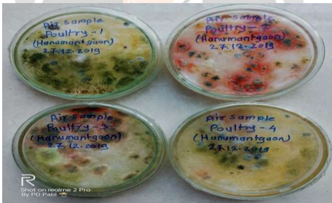
Culture Plates showing fungal colonies of Poultry farm

Photograph of slide are mount are taken with the help of mobile phone camera. Identification of fungal species was based on microscopic observation and using mycological literature ( Hussain et.al 2014 ).