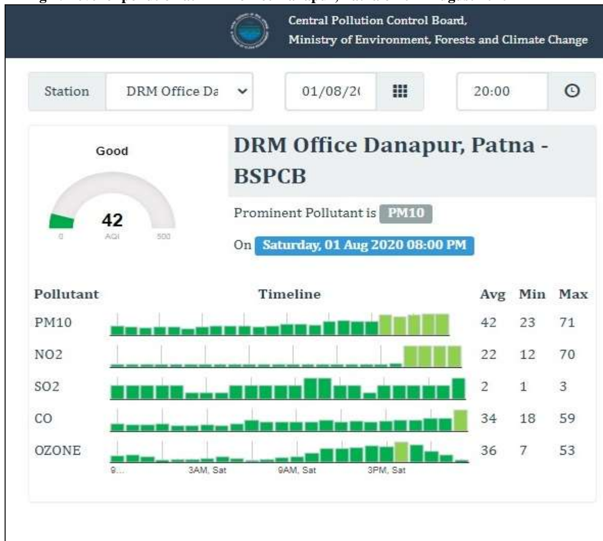
Fig-4. Level of pollution at DRM office Danapur, Patna on 01 st August 2020

Source- Central Pollution Control Board, GoI