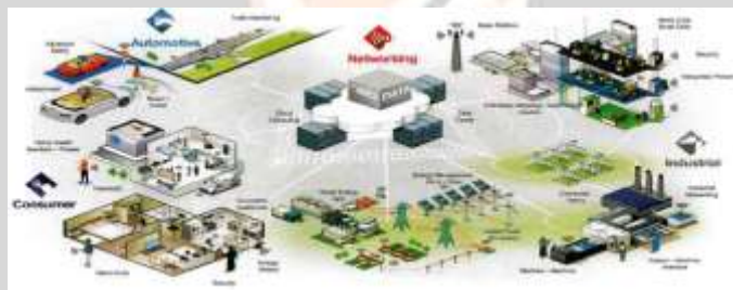
Figure 1. Shows different applications of internet of things in all aspects of life

IoT is growing, it is stepping into every aspect of our lives. This leads to an easier life through wider range of applications, such as electronic health care solutions [12] and Smart city concept. The concept of Smart city aims to making a better use of resources, increasing services quality overfed to the citizens, and reducing costs of the public administrations [10]. Another application is home automation which is the focus of this project.