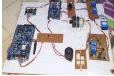
Fig-5 Hardware connections