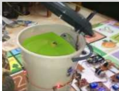
Fig-4 Inner view of Smart Dustbin