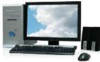
Fig-2 Server Section

The automatic open and closing of the lid is controlled by a DC motor. Moisture sensor is used to detect the water content in the garbage, it is placed in the non-metallic side of the dustbin. Gas sensor is used to detect the toxic gases, odours which is generated by the wastes in the dustbin, if the toxic gases are identified, the information is sent to an alert unit immediately. This sensor is mainly used for controlling the diseases spreading across.