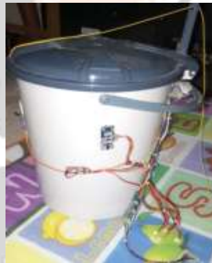
Fig-3 Outer view of Smart Dustbin