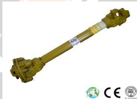
Fig-3: Universal joint

We the universal joint as one of the oldest among the all flexible couplings. It is commonly well known for its use on four wheelers and heavy motor vehicles like trucks, buses, etc. A universal joint is made up of two right angled (90 degree) shaft yokes to each other and a Yoke joining four-point cross. The cross fits inside the bearing cap assemblies, which are pressed into the eyes of yokes. Industrial applications runs without stopping.