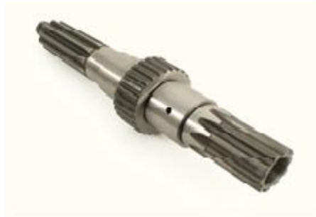
Fig.2 power tack of shaft