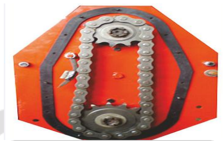
Fig-5: Chain drive

A chain drive consist of an endless chain running around two sprocket wheels as shown in fig-6. The chain drive possess specifications which are common to both the V-belt drives and the gear drives. There is no slippage in chain drive. Compared to belt drive, it is a positive drive. The power can be transmitted by the chain drive from input shaft to output shaft.