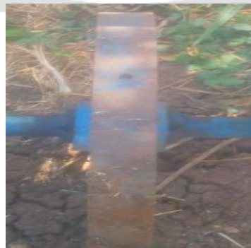
Fig.7 balancing wheel

Balancing wheel is a mechanical comp that is used for the application of balancing weight or stable the plant cutting machine. it is used only when the cultivation of soil is tacks place or in the application of grass