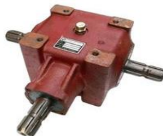
Fig-4: Gear housing

It is employed for transitions of power from the PTO shaft to the plant cutting machine through universal joint. The analysis was done for the housing without the any revolving parts (such as gears, shafts, and bearings). Rigid and flexible mounting conditions for the gear housing are taken into consideration in this analysis. The simulation of realistic mounting condition is obtained on a rotorcraft with the flexuous support, and for comparison purposes, the rigid one is analyzed.