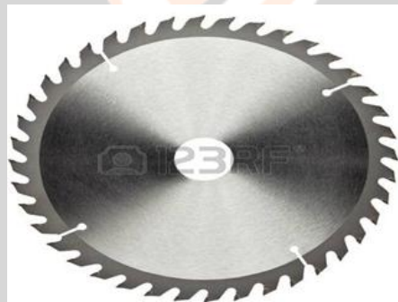
Fig-6: Cutting blades

A circular saw is a power saw having a toothed or abrasive disc or blade for cutting different leaves using a rotary motion spinning around a arbor's hole saw and a ring cutter also uses a rotary motion but is different from a circular saws and may also be loosely used for the blade itself. Circular saws were invented in the late 18th century.