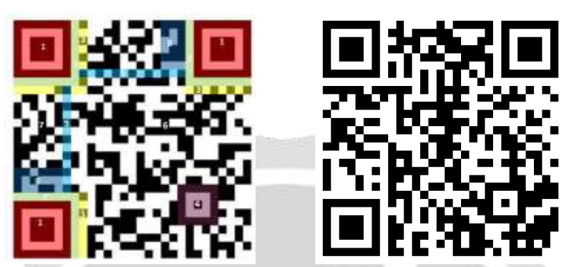
Fig -1: Schematic Diagram of QR Code

The structure of a QR code consists of a 2D matrix where each cell is of 1pixel area. In general, QR code consists of square black modules on a white background where the black square defines 0 in binary and the white square defines 1 in binary. In practice, the whole part of a QR code isn't used for only storing information, rather it consists of different sections. In this section we will review the sections in a QR Code