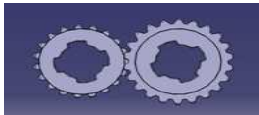
Fig. 1 3D model of Spur Gear

The noise emitted into the surroundings by the gearbox is mostly the consequence of natural oscillation of the housing. It is also necessary to systematically study natural frequency and vibration mode sensitivities and their veering characters to identify the parameters critical to gear vibration. In addition, practical gears may be mistuned by mesh stiffness variation, manufacturing imperfections and assembling errors. For some symmetric structures, such as turbine blades, space antennae, and multi-span beams, small disorders may dramatically change the vibration.