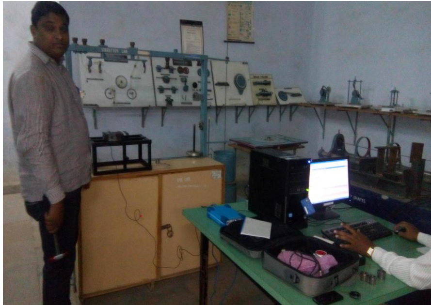
Fig .2 Test set up

It is proposed to induce a defect on a particular tooth of a chosen gear in the gear box & generate the vibrations. To sense the vibration signal generated by the gearbox an accelerometer has been used. In order to process the vibration signal sensed by the accelerometer on FFT Analyzer has been selected. With the use of experimental set up we can identify the natural frequencies for the component using the principle of resonance. Typically FFT Analyzer is used for determining the same. The computational approach given results more close to practical values through analyses.[7]