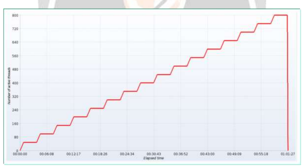
Figure 8 Graph of Number of threads v/s elapsed time for average load predefined step size.

Figure 7 shows the Alarm notification to end user to inform them about the severity condition of the system. Component indicates sensor name, topic name indicates topic of the alarm message, statistics indicates parameters of the system and alarm value indicates parameter value which is out of good range.