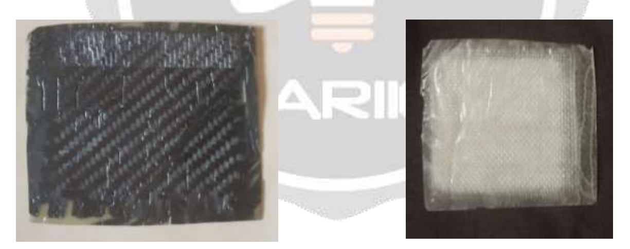
Fig – 4 : CFRP laminate