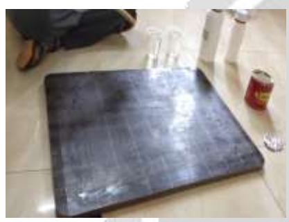
Fig-1 : Mould preparation