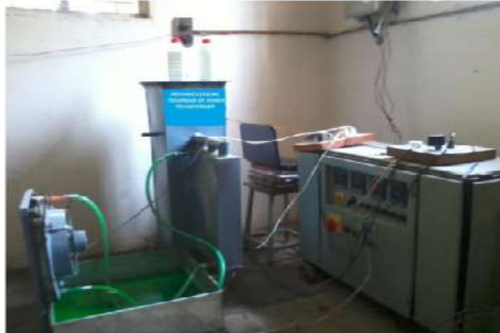
Fig-:3 Practical working model of cooling system in lab

Tank has oil pipes in which oil circulate by natural phenomena of hot oil and cold oil through these pipes oil naturally cooled. Surround the oil pipes water circulate with the help of water pump as shown in fig2 ,water cools hot oil of tank that is flowing inside the pipes. Water filled in a water tank with a certain limed and put a pump for circulate water surround oil pipes, cold water use as a coolant for hot oil after complete the cycle hot water goes inside air forced cooling system . in air forced cooling system a fan is connected with a carburettor , now hot water comes inside the carburettor and hot water cooled by air cooling that cooled water go back to the water tank, again this process go on for maintain the temperature of hot oil.