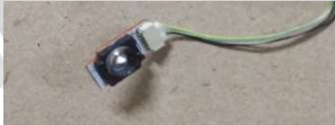
Fig-2: Micro mirror lens

The light emitted from the LED source falls on DMD, and it is converged using dichroic filters, the illumination is converged through the prism which can be adjusted to fall on the screen. The lens can be adjusted to make the image clear from the focus.