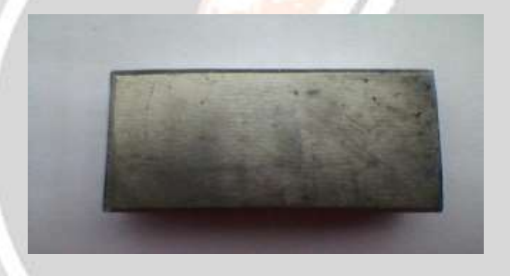
Figure 1showing work piece before machining

EWR = <u>mass before machining – mass after machining (gram)</u> time of machining (sec)