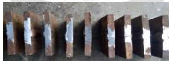
Fig 1 Experiments 1- 9