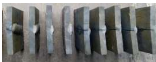
Fig 2. After Etching 1-9