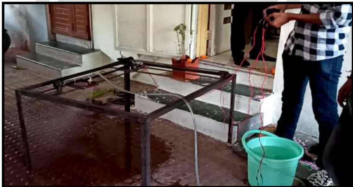
Figure. Actual model of overhead pesticide sprayer