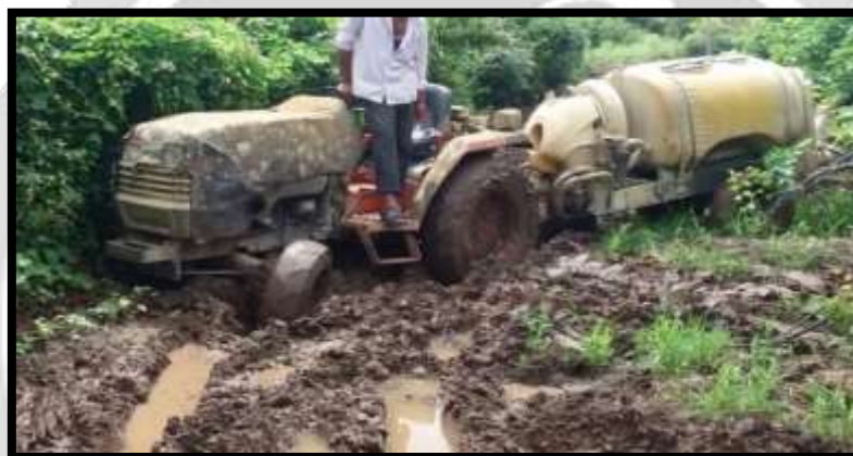
Figure. problem statement – 2