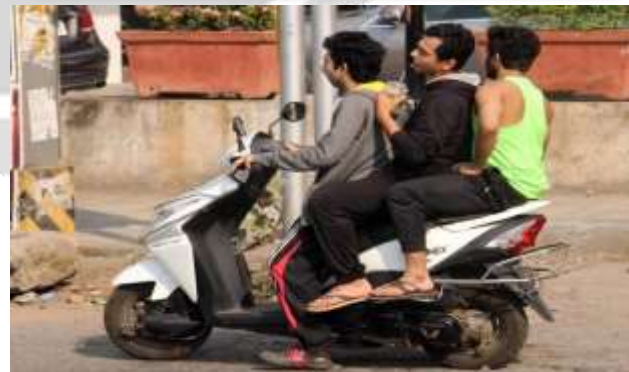
Fig. overlod & overseat privention