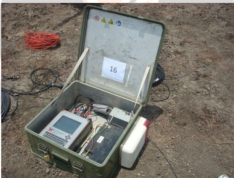
Fig. 6 MT Equipments

The MT method is very powerful geophysical tool to detect enhanced conductivity structure in the crust due to aqueous fluids, metallic minerals, interconnected graphite films and partial melt. Supplementary data like gravity, heat flow and seismic velocities are necessary in most cases to distinguish the source of the conductivity (Heise et al., 2006).