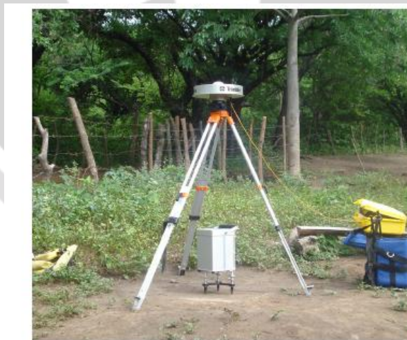
Fig. 5 Gravity Data Acquisition

The measured Bouguer gravity data (over a specified grid) gives the effect of gravity due to sediments and basements. The objective of the survey is to identify anomalies having density different other than that of the background. Once necessary corrections are applied to the data, the Bouguer gravity is separated to regional and residual. And the residual gravity interpretation gives the Geophysical anomalies (Sircar et al., 2015).