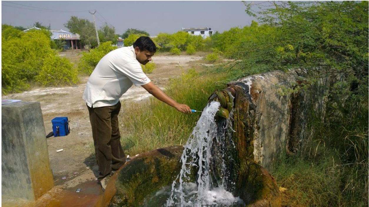
Fig. 2 Geochemical Analysis