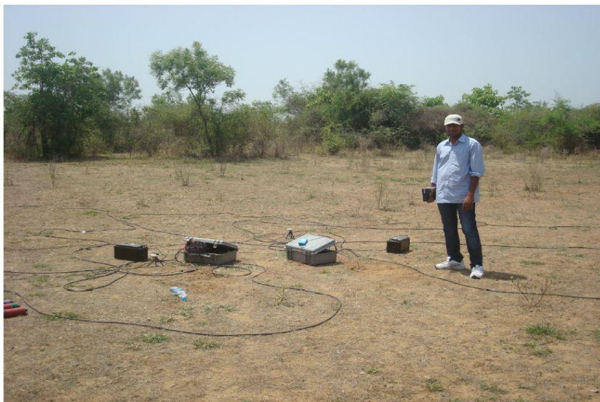
Fig. 7 MT Acquisition

Electrical Resistivity methods have been very successfully used in geothermal exploration to identify subsurface anomalies. Change in the electrical resistivity of the rock fluid volume is dependent on hydrothermal alteration and heat flow data (Moskowitz and Norton, 1977). Resistivity sounding and profiling are two most commonly applied procedures on the field for estimating underground resistivity. The objective of resistivity sounding is to estimate variation of resistivity values with depth below a given point. Such type of measurements are required when the ground consists of a number of more or less horizontal layers. The object of resistivity profiling is to detect the lateral variation of resistivity of the ground. This kind of survey is undertaken to delineate underground anomalies which has low resistivity values (Moskowitz and Norton, 1977).