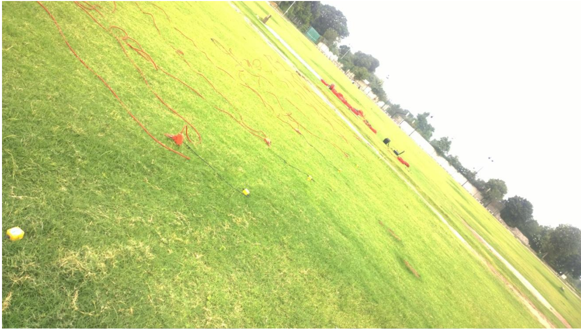
Fig. 3 Seismic Acquisition