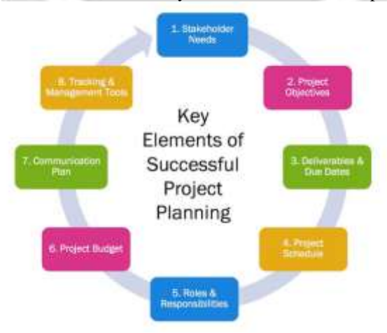
Figure.6. KEY ELEMENTS OF SUCCESSFUL PROJECT PLANNING

Integrated ecosystem: To expand your Salesforce environment, the AppExchange offers thousands of applications, parts, and consulting services. Discover resources for budgeting, document signing, resource management, and much more. Increase the return on your IT investments with pre-built connectors.