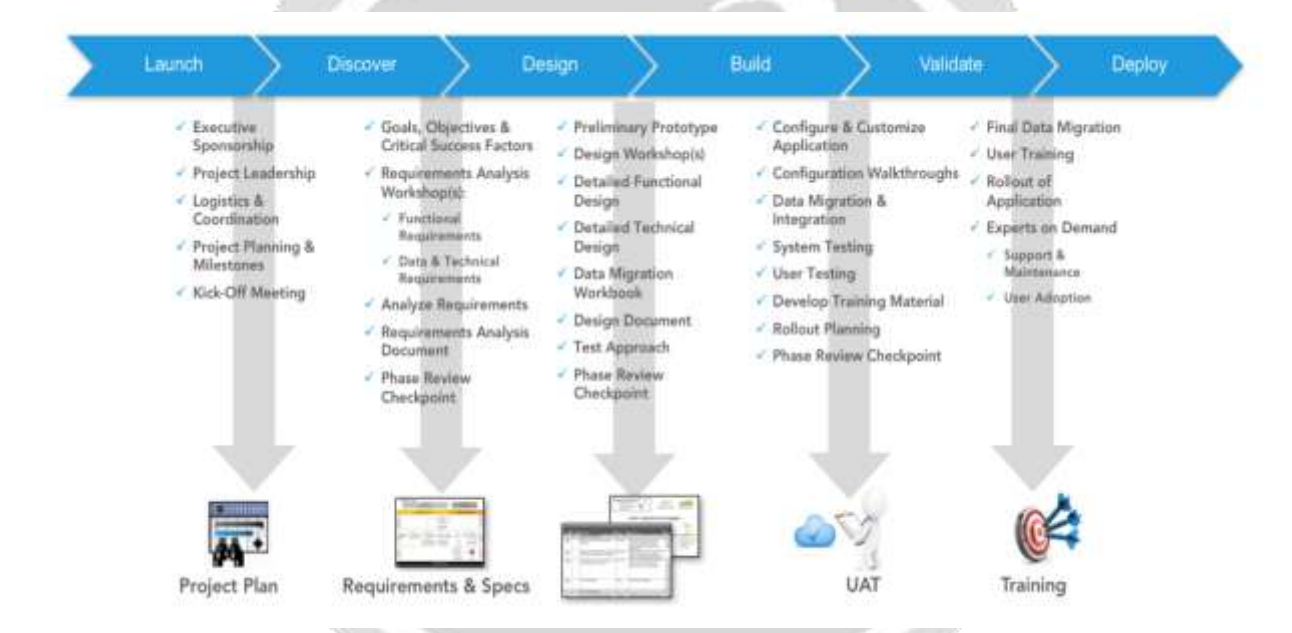
Figure 2. INTEGRATION WITH SALESFORCE FLOW

To take advantage of current data and improve functionality, seamlessly integrate the project management system with other Salesforce modules and outside apps.