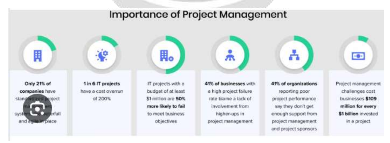
Figure.4. IMPORTANCE OF PROJECT MANAGEMENT

Closing: Bringing the project to a formal end by delivering the finished product, turning it over to the operations team, and conducting a project performance evaluation. Lessons are accumulated to help with upcoming initiatives.