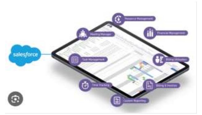
Figure.3. PROJECT MANAGEMENTS

The effort necessary to complete the major objectives and deliverables must be precisely defined. The scope establishes the focus and limits for what will be accomplished. Determining the order of steps necessary to finish the project by the deadline. This is accomplished by creating a timetable that takes job dependencies, resource availability, and durations into account.