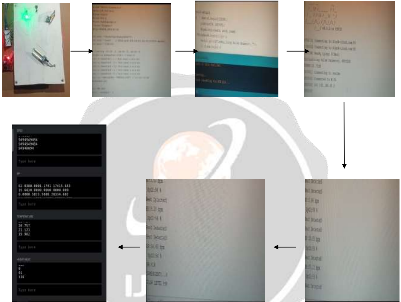
Fig-3: Implementation of Hardware

(iii). Storing Data in cloud, processing and retrieving the recovery prediction rate: using some Machine Learning Algorithm via PYTHON language in Anaconda Jupyter Notebook, we in turn retrieve the recovery rate in mobile applications created via BLYNK.