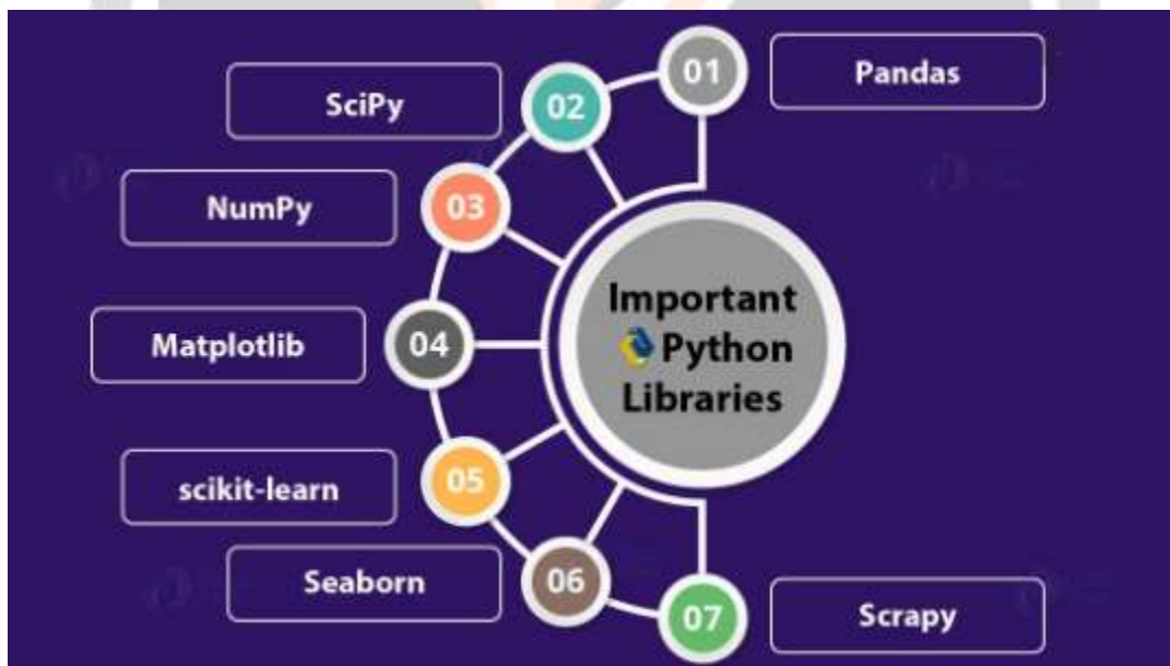
Fig-1 Most important libraries included in python