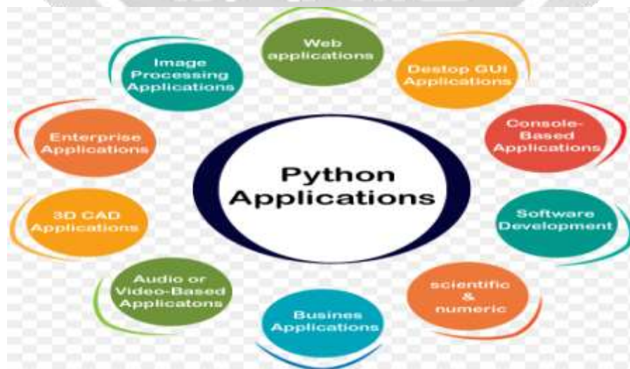
Fig-2 Python application types diagram