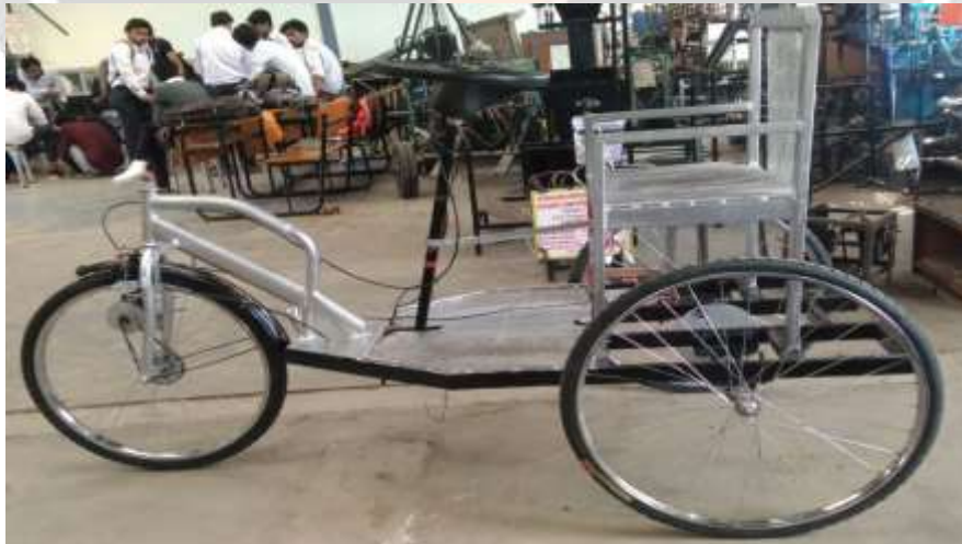
Fig: fabricated view of tricycle

It is the same working principle of DC motor when a current carrying conductor is comes inside a magnetic field a mechanical force experienced by the conductor and we define the direction of this force by Fleming's left hand rule. It is the same in permanent magnet; we place the armature inside the magnetic field of the permanent magnet and this armature rotates in the direction of generated force and the compilation of force produced by each conductor produces a torque which tends to rotate compilation of force produced by each conductor produces a torque which tends to rotate the armature.