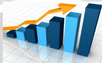
Fig -2 : Progress graph

It is of course important not to confuse Six Sigma with TQM or to try to put parallels between them. Six Sigma brings an excellent structure to implement TQM since it constantly drives the improvement wheel and helps people see the art of the possible and 'what can be done' to improve quality. TQM is really what the customer identifies with because it is a measure of value creation on their behalf. Six Sigma is the 'evidence of delivering value'. Zero Defect has to be translated as Zero Defection ultimately. In all, the prognosis for Six Sigma looks good, even the best are not good enough