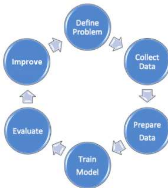
Fig. process of machine learning [12]

Any machine learning task can be broken down into a series of steps: