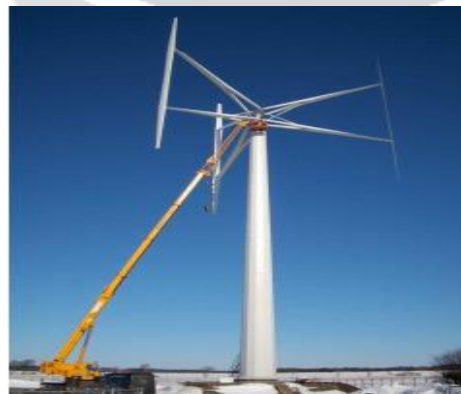
Fig-1: Vertical Wind giromill wind turbine

At present, Aluminum blades fabricated by extrusion and bending are the most common type of VAWT materials. The major problem with Aluminum alloy for wind turbine application is its poor fatigue properties and its allowable stress levels in dynamic application decrease quite markedly at increasing numbers of cyclic stress applications. Under this backdrop, an attempt has been made in this paper to investigate alternative materials as SB-VAWT blade material.