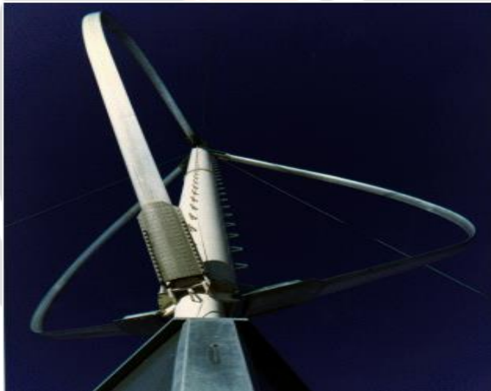
Fig-2: Three-bladed Darrieus wind turbine

Among all these requirements, fatigue is the major problem facing both HAWTs and VAWTs and an operating turbine is exposed to many alternating stress cycles and can easily be exposed to more than 10 8 cycles during a 30 year life time [2]. The sources of alternating stresses are due to the dynamics of the wind turbine structure itself as well as periodic variations of input forces [2].