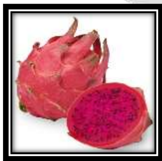
Fig -1: Dragon fruit

A dragon or dragon fruit is the fruit of several cactus species indigenous to the Americas. Hylocereus polyrhizus and Hylocereus undatus are two varieties of the commonly called dragon fruits, belongs to the Cactaceae family and dragon fruits have gained popularity in many countries all over the world. The dragon fruit has spines that grows up to 1 kilogram in weight. Dragon fruit skin may be yellowish to dark red in color with edible flesh that maybe white or red depending on the variety. It has a lot of black small seeds that is also edible. Dragon fruit is rich in naturally-occurring flavonoids, which are primarily found in dragon fruit peel. Dragon fruit is also rich in phyto albumins which are highly valued for their antioxidant properties. It helps us to fight free radicals in our body. It also helps to slow down the aging process after the free radicals are reduced. Due to this, the skin looks young, flexible and tight. Dragon fruit contains high amounts of vitamin C, vitamin B1, B2, and B3. It is also rich in many important minerals as iron, calcium, phosphorus. Apart from this, it contains a good proportion of protein, fiber and niacin and last but not the least, 80 percent water. Hence you can easily call it a 'super fruit' that helps in enhancing nutrition and corrects body ailments. Not only that, dragon fruit can be a vital ingredient in your daily beauty regime even. Dragon fruit seeds contain unsaturated fat and fights bad cholesterol.