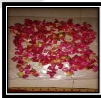
Fig -2: Dragon fruit peel