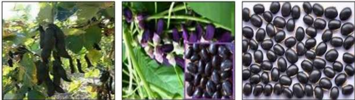
Fig. 1: Mucuna pruriens .

From the Himalayas to Cape Comorin in the plains and up to 3000 ft. above sea level, wild Mucuna pruriens plants may be found across India's countryside. Assam, Bengal, the Khasi Hills, and the Deccan are the most common locations to find it. The hairs are present in the early stage, but go away as the plant ages. Leaflets are 2–3 mm long, and the flower heads range in length from 15–32 mm and feature 2–3 blooms in white and purple. The seed pods are 10 cm long [10] and coated with loose hairs that cause severe itching when they come into touch with skin. The husk is hairy and contains seven seeds (Figure 1).