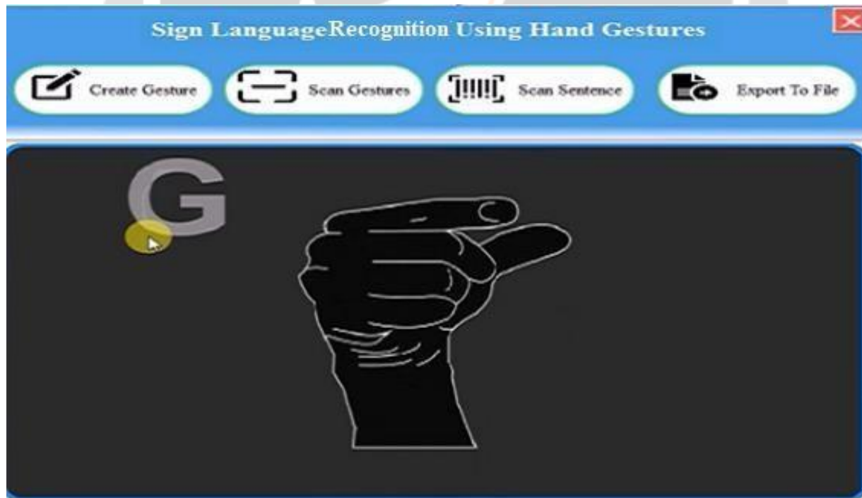
Fig 3. Dashboard with Sample Gesture Animation.