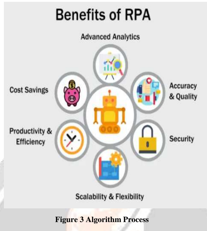
Figure 3 Algorithm Process