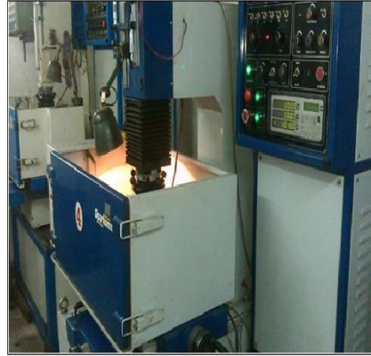
Fig 1: EDM Machine in Working Process

Although the physical design can be done using the facilities or the faculties above, the assessment of the geometry for conformance to the conditions specified (test conditions) could be done through the utilization of a suitable tool – software for analysis in the domain of structural analysis. With the past experience of the sponsoring company in this field, ‘ANSYS’ appears to be a competent tool to pursue analysis for this project work.