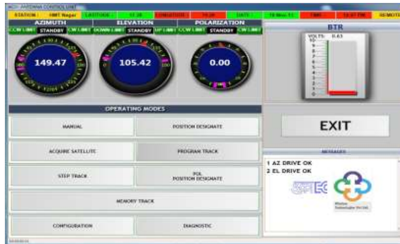
Fig-2: Antenna Control Unit