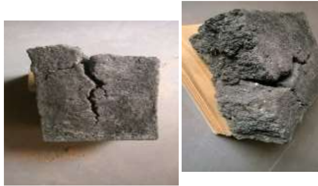
Fig- SAMPLE B