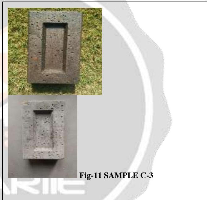
Fig-11 SAMPLE C-3