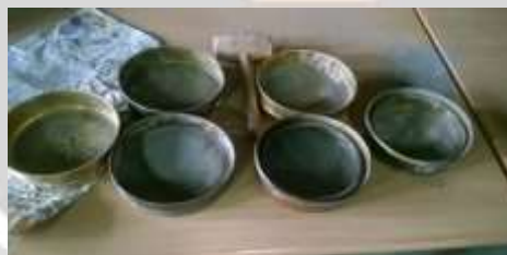
Fig -FLY ASH