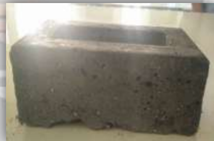
Fig-9 SAMPLE C-1