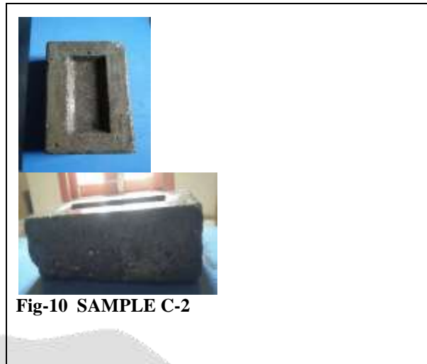
Fig-10 SAMPLE C-2