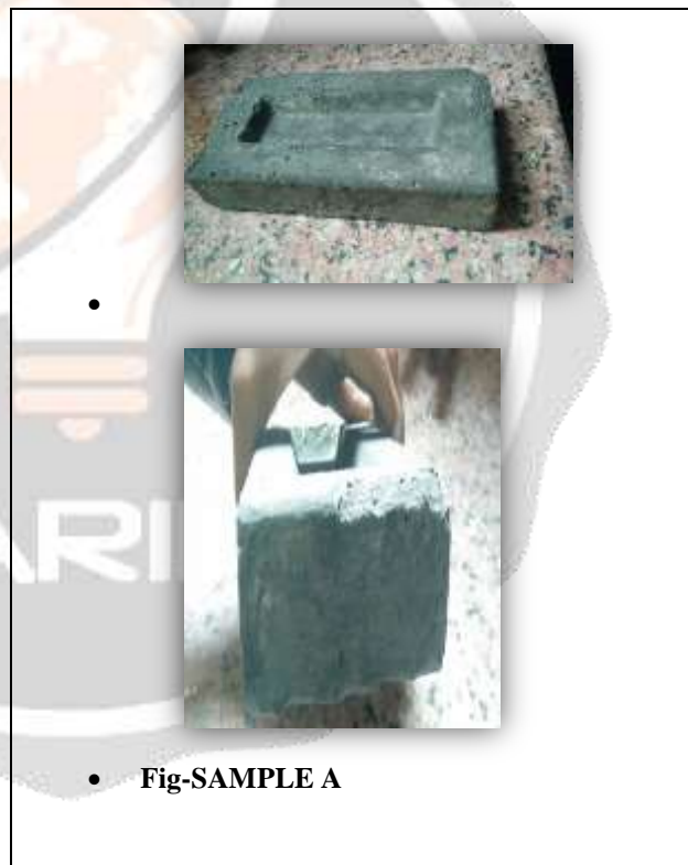
• Fig-SAMPLE A

The sample failed due to bulging and crack appeared on the bricks