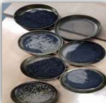
Fig 3- Brick Kiln Dust