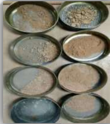
Fig 4- Sieve Analysis of Rice Husk Ash