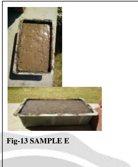
Fig-13 SAMPLE E