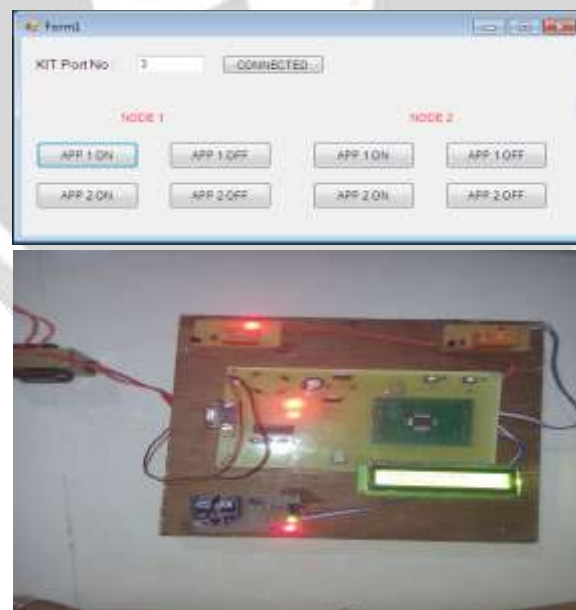
Fig 3.Experimental result

To on Application 1 of the Node 1, Click on the button APP 1 ON of the NODE 1 on GUI.