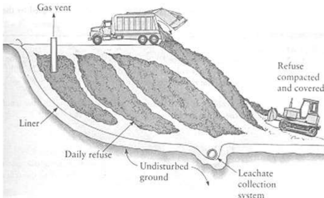
Figure: A Typical Sanitary Landfill for Solid Waste

landfill sites which continue to be used for more than five years shall be improved in accordance of the specifications given in the Schedule.