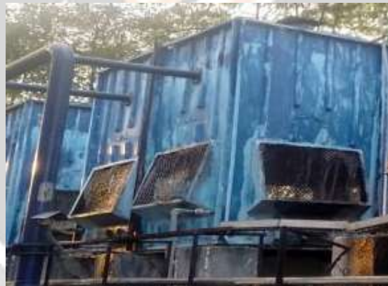
Fig -3: Actual Induced Draft Cooling Tower

tower is calculated i.e. range, approach, effectiveness and evaporation loss.