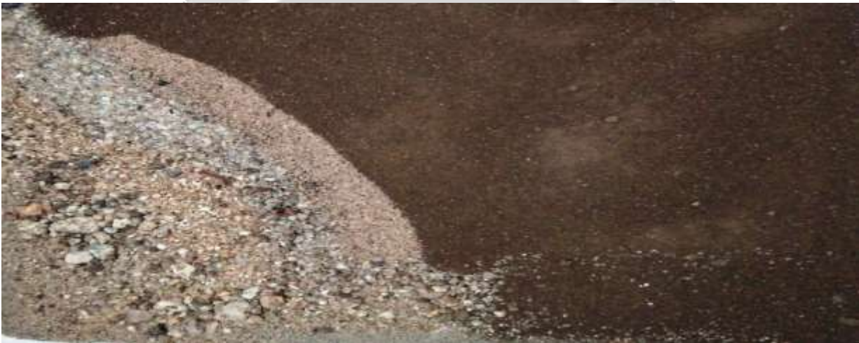
Figure 1: Different types of the component of the soil

Grain size smaller than 2 \mu constitute the very fine fraction (clay size fraction ...CF). Grains having a size between 2 \mu and about 0.1 \mu can be differentiated under the microscope but their shape cannot be discerned. The shape of grains smaller than about 1 \mu can be determined by the means of an electron microscope. Their molecule structure can be investigated by means of X-ray Analysis.