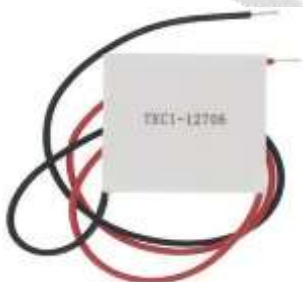
Fig-1. Thermoelectric Generator