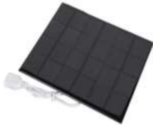
Fig-4. Solar panel