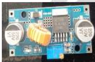
Fig-10. DC boost Converter