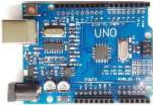
Fig-7. Arduino UNO