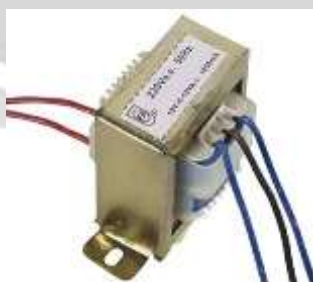
Fig-2. Step down Transformer