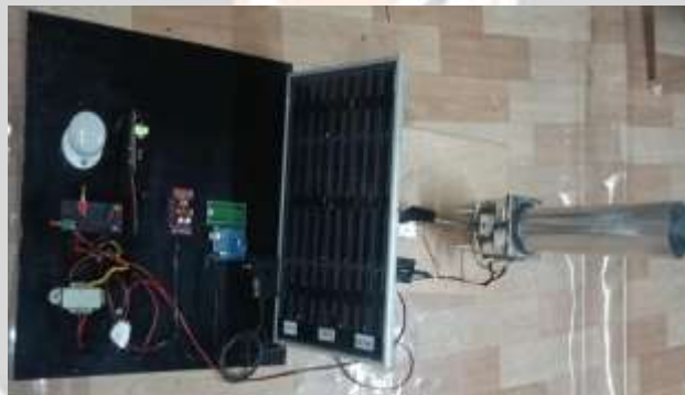
Fig-13. Working model of proposed System

To Controls and monitors the system the Arduino Controller is used. Arduino collects data from sensors. It monitors voltage, current, and system status. It also controls the display and system operation. LCD Display is also used in order to displays system parameters. It Shows real-time information such as: Voltage, Current, Power status System condition. Further the generated energy is fed to the modified Sine-wave Inverter which Converts DC power into AC power. The battery stores DC power but many appliances need AC power. This inverter converts DC to 230V AC and finally it will be supplied to the load.