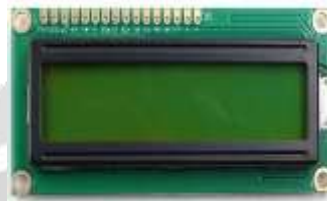
Fig-8. LCD Display