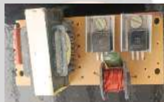
Fig-11. Modified Sine-wave Inverter