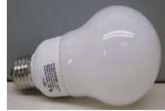
Fig-6. CFL Lamp