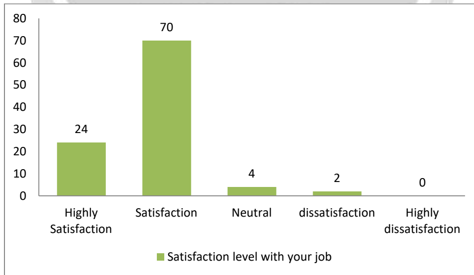
Chart -4 Level of job satisfaction with your job