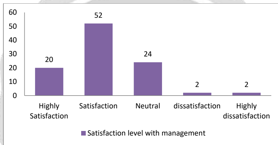
Chart -3 Level of job satisfaction with management