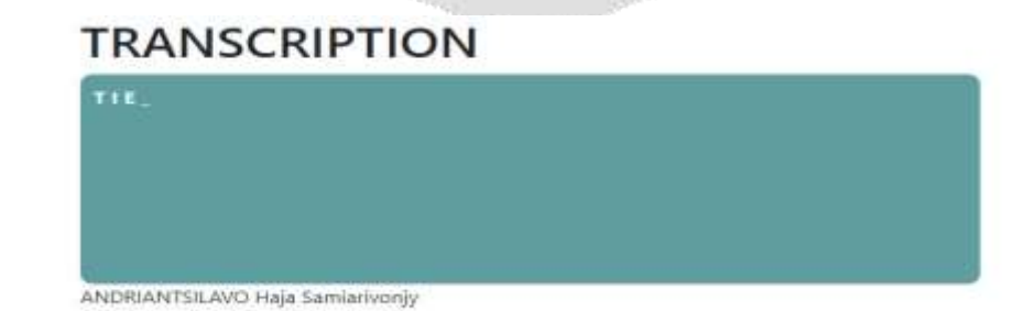
Fig -6: Transcription of the signal for the second test.

The result is "-", "-.-", "." corresponding to "TIE"