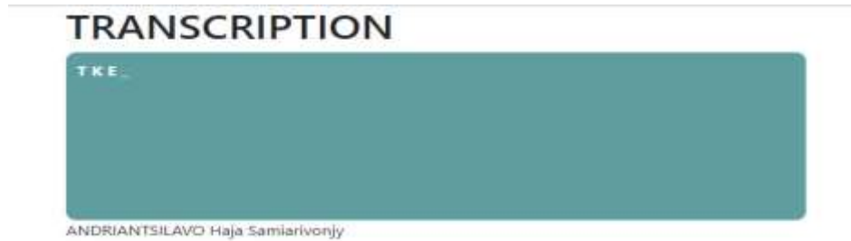
Fig -4: Transcription of the signal.

With that signal we get "-", "-.-", "." which correspond to "TKE"