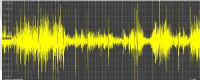
Fig -5: The waveform of the second test.

The result is "-", "-.-", "." corresponding to "TIE"