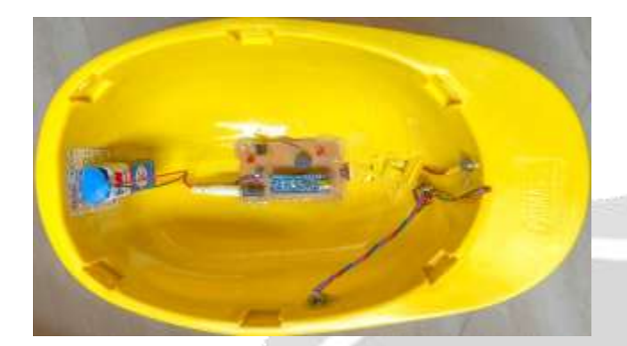
Fig 3. Circuit Connection (Inside)