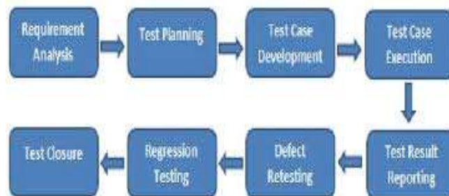
Figure 2 Software Testing Life Cycle-Phases

Software testing life cycle-phases take place throughout the software development life cycle (SDLC). It is generally divided into a number of distinct phases as following: requirements analysis, test planning, test development, test execution, evaluating exit criteria and test closure as shown in Figure 2 .