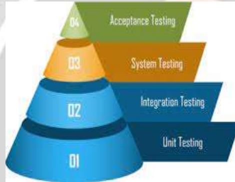
Figure 3 Testing Levels

The key issue is how quality assurance can facilitate the Software Testing and generate more test cases that are accurate and easy to execute with competitive time frame while still meeting the business requirements and the client's expectation. Artificial intelligence and its key pillars like Machine learning and NLP can play a major role in this and can facilitate the software testing in most of the areas.