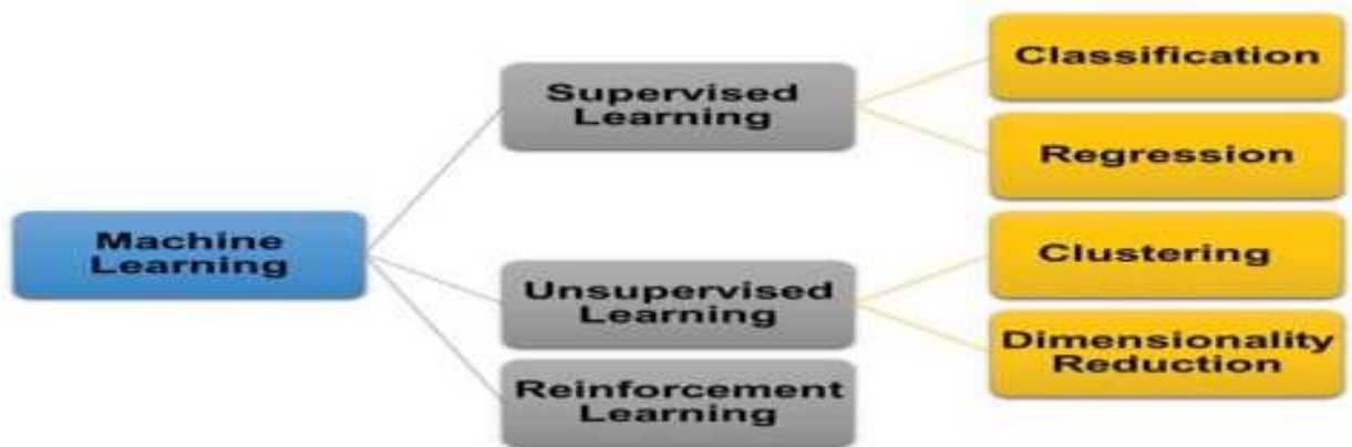
Figure 1. Machine Learning

specific context, in order to maximize its performance.