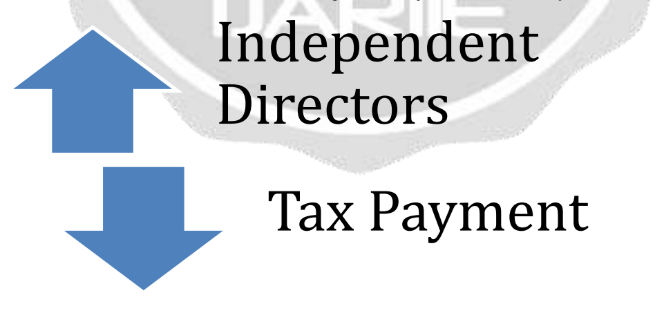
Figure 2: Board independence has a positive relation with tax payment

Husain et al., in 2021 also viewed business strategy and tax avoidance in relation to the moderating effect of ownership structure and found that the results tend to change with respect to their characteristics (Husnain et al., 2021). It has been found that the size of the board tends to have a negative relation with tax payment which suggests that the larger the board, the higher the number of tax avoidance activities, which further supports the previously conducted studies (Abdul Wahab & Holland, 2012). Whereas the results for board independence show that there is a positive relation with tax payment. If there is an increase in independent directors, then there will also be a decrease in tax avoidance activities (Fig 2) (Aburajab et al., 2019; Chytis et al., 2018).