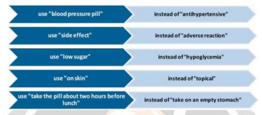
Figure 3. What a pharmacist could say instead of using medical terminology [62].

explanations in plain non-medical language, making a great effort in avoiding the use of medical jargon; 2. to focus on the message to provide and to recall it several times during the conversation; 3. to use the "teach back" tactic, also called "show me" (retroactively instructing), to check if the patient has understood the message well (e.g., the pharmacist could ask the patient to repeat what he said during the consultation, instead of asking directly if he understood); 4. to solicit the patient effectively with questions such as asking "what questions do you have to ask me?" instead of "do you have any questions?" or "questions?"; 5. to use support material, such as simply and concisely written information, together with the verbal materials, which are even better if they are accompanied by images and illustrations [62]. In general, the points mentioned should move towards an ever-increasing involvement of the patient in the communication process.