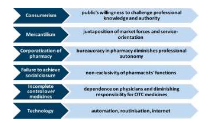
Figure 1. Factors undermining the pharmacy's professional status.