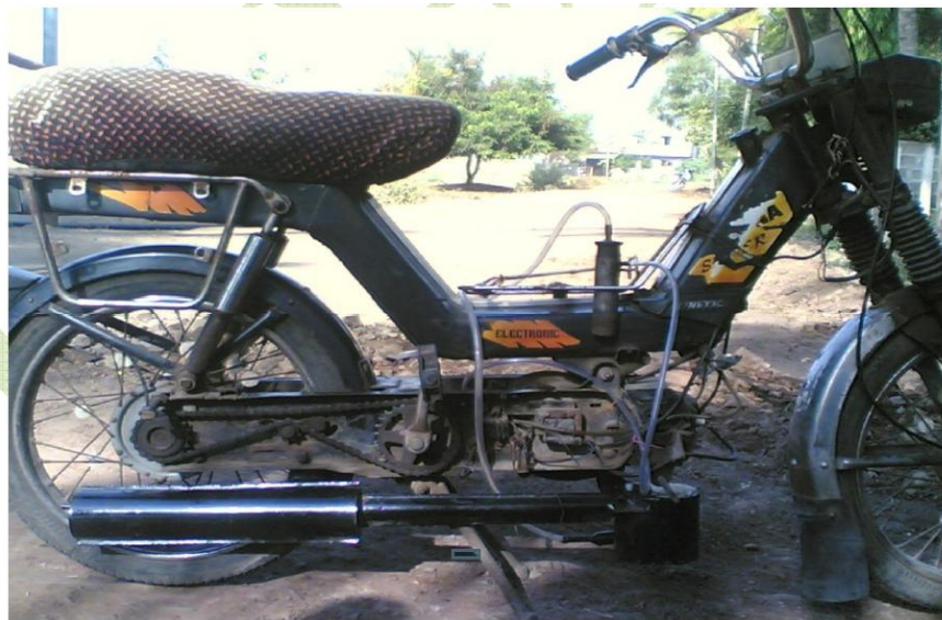
Fig: Fabricated Turbocharger with Engine Arrangement METHODOLOGY:

Arrangement:horizontal Number of cylinder:Single Cubic capacity:50cc