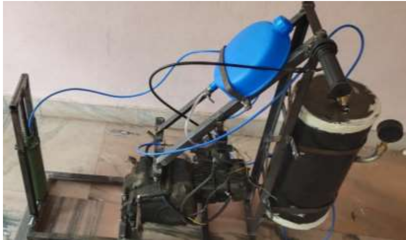
Fig-2: Fabricated setup