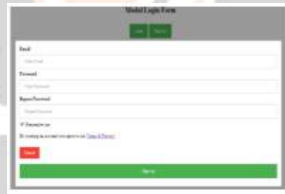
Fig 3.1 user authentication system

The user has to give login information such as his/her username, password through voice command, all operations performed will get a voice based feedback.