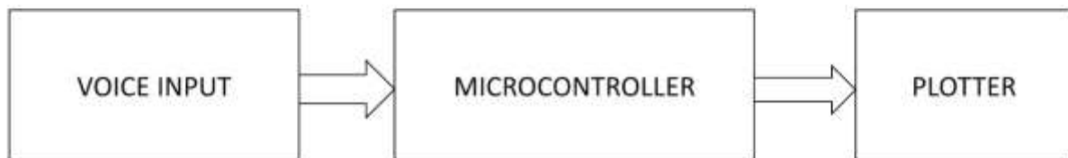
Fig-1: Simplified block diagram