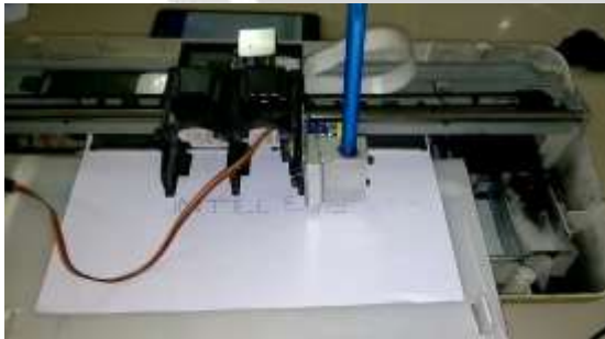
Fig-3: Plotter accessed by driving motors

The prime idea of our project is to convert human speech into textual matter without any difficulty and hassles. The major advantage is that it can write down the spoken contents on a paper . The word or speech we speak is first converted into G-code by using google translation mechanism . This specific G-code is then transferred to the writing machine is by using a Wi-Fi module attached to it. After receiving the G-code the plotter recognize and identifies the co-ordinates of each character and write the alphabet.This will helps the blind and handicapped to write based on their voice commands without errors.