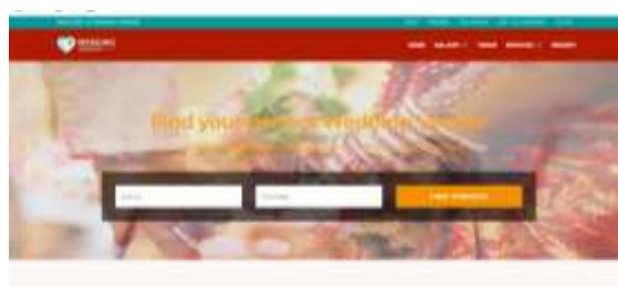
Fig. 4: The User Interface