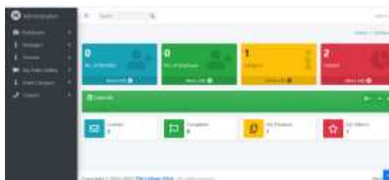
Fig. 3: Admin Interface

Several experiments were conducted to try out the functionalities and effectiveness of the web-based Wedding Planner. The tests were conducted on the functionality of the wedding planning system