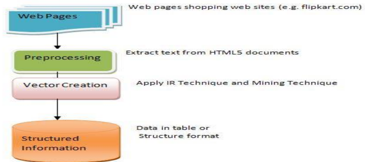
Figure 2 the Progress of Web Content Mining

The figure 2 shows the web content mining process and the information retrieved in the structured format. Based on the documents in the web the traditional methods are partitioned into four parts [3] [7].