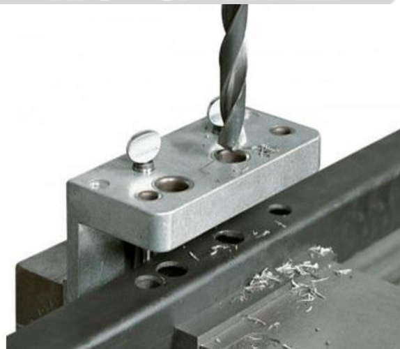
FIG. 1. JIGS

While performing the machining operation jigs is use to guide are used to guide a position or to give support to the tool. Its main objective is to ensure high degree of precision, interchangeability, and duplication in products 'manufacturing, it is also applied to manipulate the location and movement of other tool. The machining operation like drilling, reaming, tapping and counter boring.